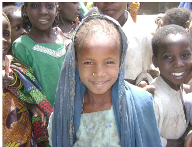
LBNF Poster Child