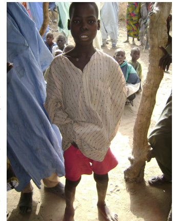
Indeed, the Lame shall walk