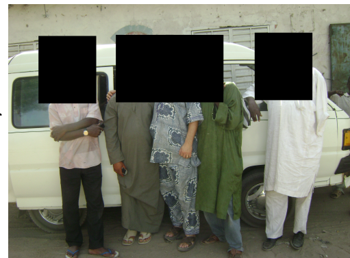
The LBNF Dream Team 2009

There were dozens of miracles, but first let me give you an overall summary of the work of the Spirit of Jesus. All villages were set up by M, Jehu, and E, all evangelists, the latter two interpreters for Kanuri, Hossa, Fulfulde, French and English.