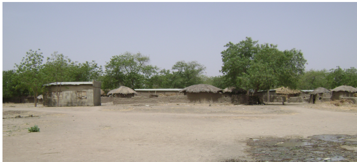
Village of Ndigna in Cameroon.

to his prayer and he would take responsibility to pastor the new church. Hallelujah! This may be the first recognized church among the Kanuri people. The chief has promised land for a more permanent church structure. The challenge for me now is to help them get their well re-drilled to provide consistent clean water year-round.