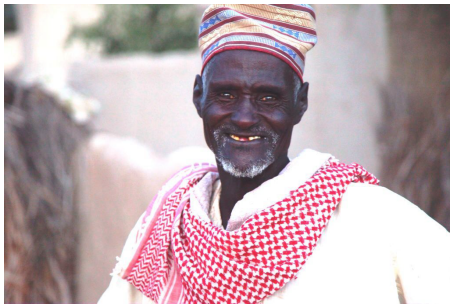
Lost Kanembou man.

Many of you who get this newsletter are hard-working, trained, skilled at what you do and have counted the costs to be where you are. You are movers and shakers in the Kingdom of God. Whether you give to your local church, a