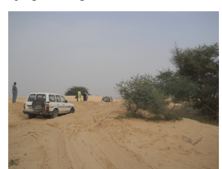
LBNF spent over $6,000 on 4x4 rentals this year and more next year. Will you help, pray, talk, give? Let me come to speak at your church?