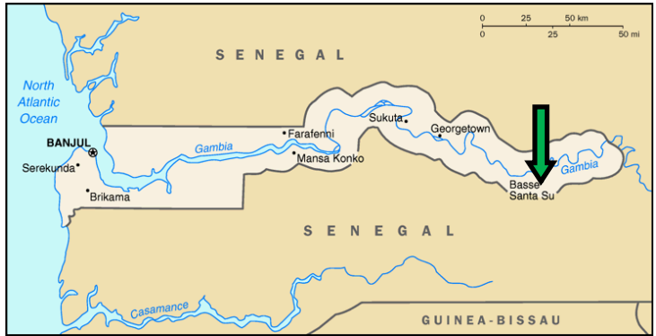
The Gambia, (sandwiched in Senegal). The green arrow is the general area where we ministered. One village was three hours away.