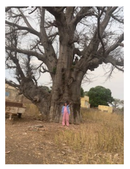
A huge African tree in the village of Sare' Bona, home of a newborn disciple, Chief M. I am in pink.